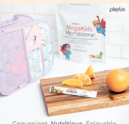
Convenient. Nutritious. Enjoyable.