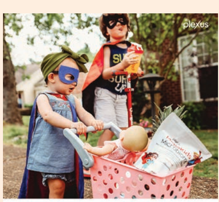
DHA + Lutein + Choline + Prebiotic Fiber