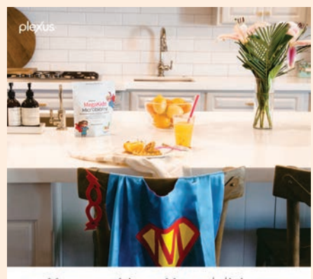
Mega nutritious. Mega delicious.